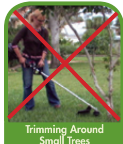
Trimming Around Small Trees

Be careful when trimming around trees. Your trees should have a protective ring of mulch around their trunks so that the trimmer string won't come in contact with the trunk. Repeatedly cutting the bark can damage even a mature tree. Never string trim around young trees if there is any chance at all the string will contact the trunk.