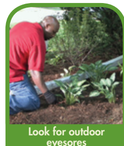
Look for outdoor eyesores

Look for any potential eyesores, such as the air conditioning unit, with appropriate bushes and plants. Place the plants far enough away so they don't block airflow. If your neighbor's house seems a little too close, but a fence is not the right answer, plant a row of arborvitae. If you prefer a softer look, use a variety of bushes and plants to create a visual screen.