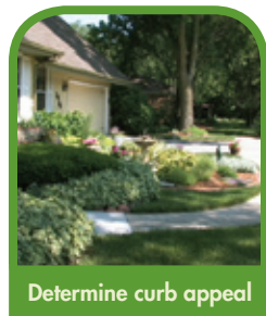
Determine curb appeal

What is your home's most attractive feature? Look for easy ways to make your home more inviting, like adding foundation plantings that soften the approach to the front door. To soften angles, consider a curved walkway and a casual, perennial flowerbed. A front door in a bold color that contrast with the house can also add curb appeal.